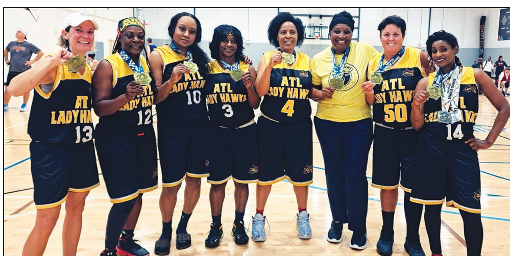
From Savannah to the national stage, the ATL Lady Hawks prove that passion, sisterhood, and greatness have no limits.