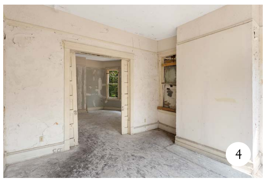
1) Exterior view of 706 E. Henry, southeast facade 2) Front foyer 3) Front parlor, facing south 4) Front parlor facing north toward Dining Room