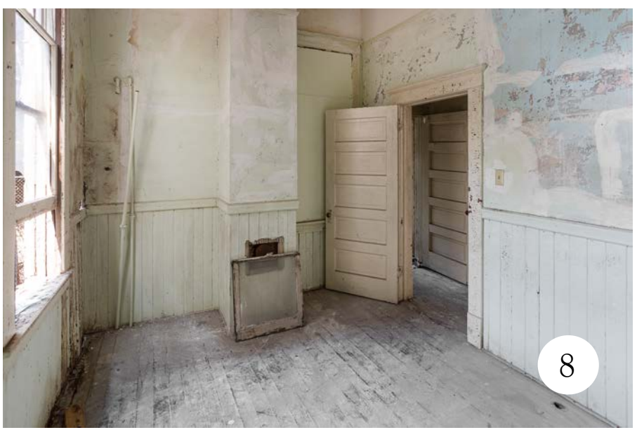
5) Dining Room 6) Kitchen facing North 7) Kitchen facing South 8) Bedroom #1, first floor