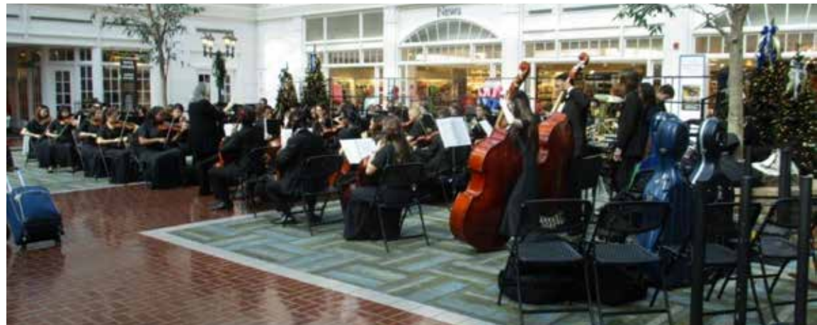
Savannah Arts Performs at the Savannah/Hilton Head Airport for the holidays!