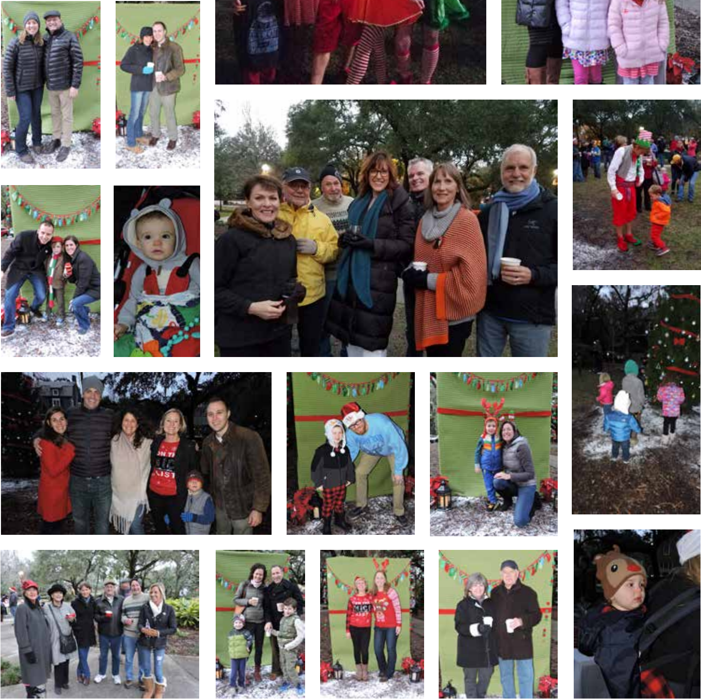
Snowmageddon 2018! We are good for another 20 years...

It's always strange to put the APCCNA tree lighting in February but due to deadlines, this is the first opportunity. It was certainly cold that night and we didn't know the fake snow would be real in a month! Thank you to the Don Callahan team for sponsoring the event! It was a great turn out!